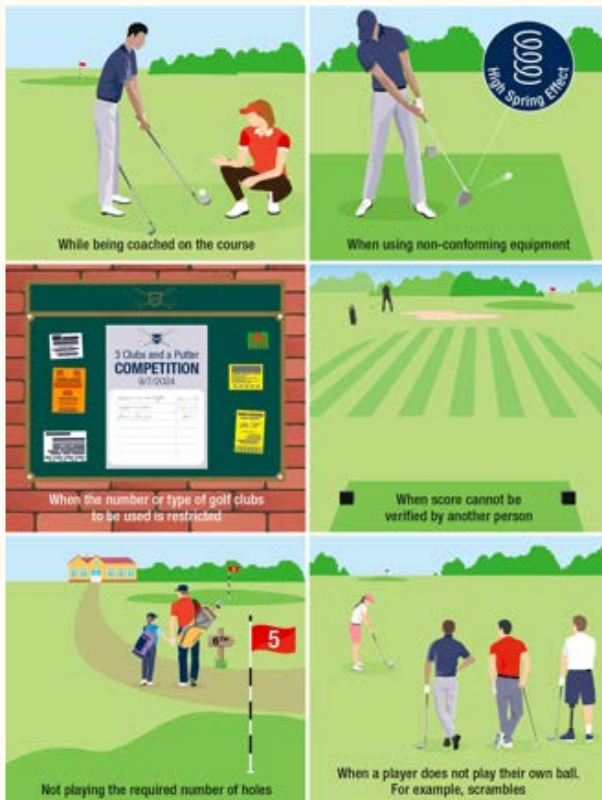
Illustration from page 32 in the USGA Rules of Handicap

The following illustrative list is not exhaustive and if a player is in doubt as to the acceptability of a score, it is recommended that they check with the golf club where they are playing or the Authorized Association.